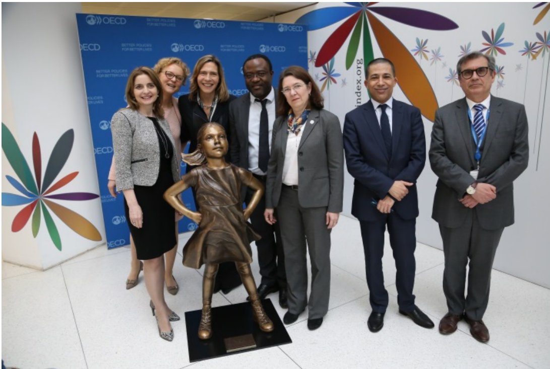
Session speakers and the organisers with the “Fearless Girl” statue loaned to the OECD for March on Gender month.

The conclusions of this meeting will nourish on-going work by the OECD, notably to continue collecting good practices on legal reform for women’s economic empowerment as this responds to country requests and real needs.